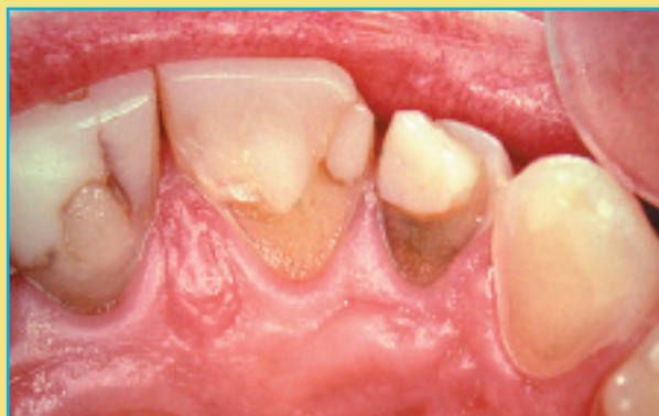
Over time, frequent reflux will dissolve enamel and expose underlying dentine